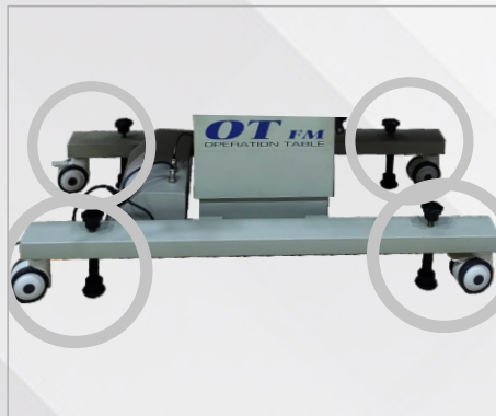
Stable Base with Mobility