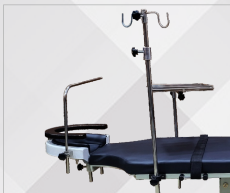
304 SS Accessories