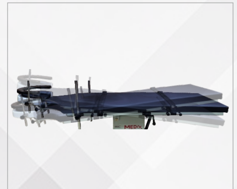
Bed Tilt System