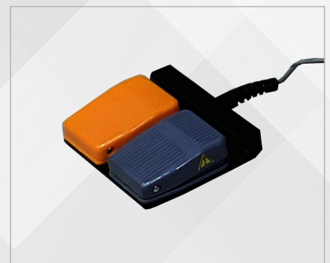
Easy Foot Switch Control